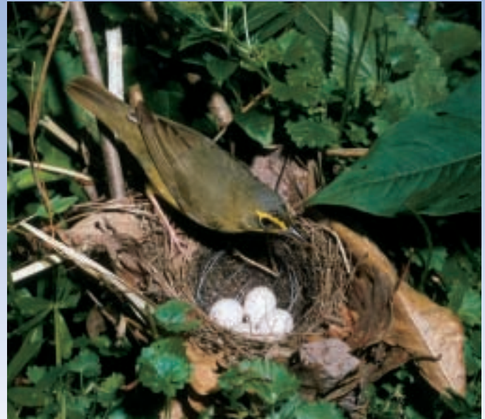
This Kentucky warbler is tending her nest of eggs. A similar species in the tropics would lay fewer eggs. Why?

A second idea, put forward a few years earlier in 1947 by a colleague of Moreau's, David Lack, was more promising. Lack, one of the twentieth-century's great biologists, argued that few if any birds ever produce as many eggs as they might under ideal conditions, for the simple reason that conditions in nature are rarely ideal. Natural selection will indeed tend to maximize reproduc-