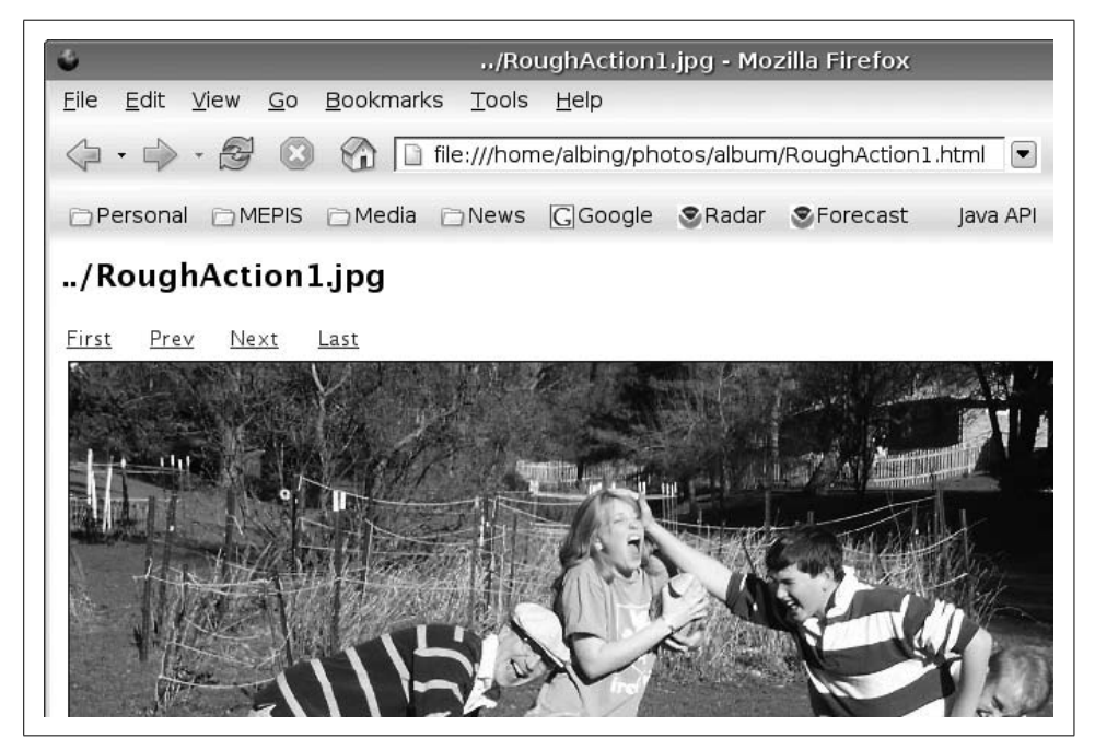
Figure 12-1. Sample mkalbum web page

The large title is the photo (i.e., the filename); there are hyperlinks to other pages for first, last, next, and previous.