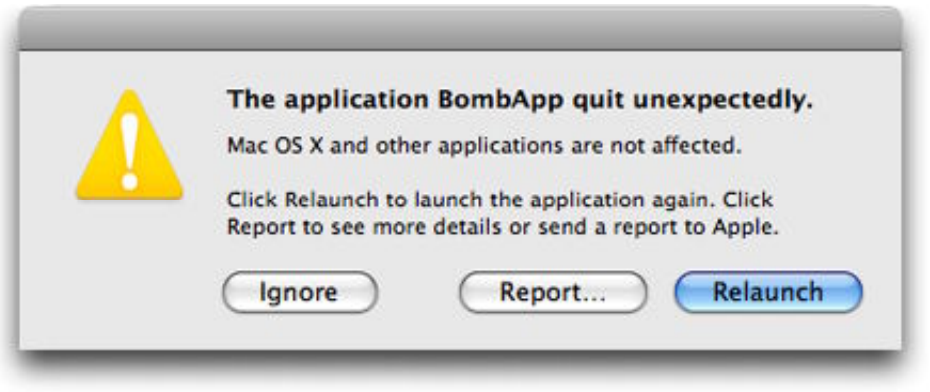
Figure 9: The first time an application crashes, a dialog like this usually appears. Click Relaunch to launch it again.

When an application crashes in Mac OS X, it usually disappears without warning. A few seconds later, a dialog like the one shown in Figure 9 appears.<sup>2</sup> Translation: Something went wrong. We don't know what. You can launch the application again and keep your fingers crossed that it won't happen again.