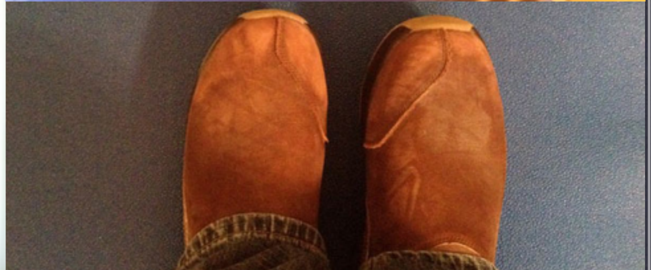
Clockwise from top left: Treadmill Side Desk Angle, Day One With the Standing Desk, My Feet, Treadmill iPad Desk